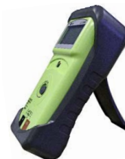
EZ 100 shown with standard A101 tilt stand protective boot

EZ 100 Comes Complete With: (2) A002 1.5V Battery, A040 Test Lead Set, A101 Rubber Boot